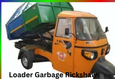
Loader Garbage Rickshaw