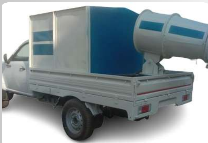
ANTY SMOG MACHINE