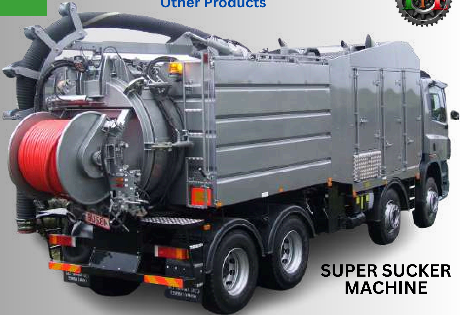
SUPER SUCKER MACHINE