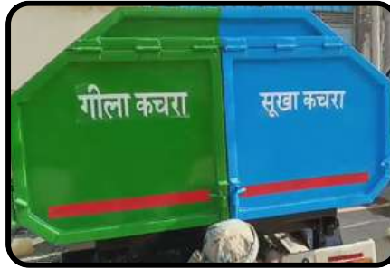
Partition View Close body Garbage Tipper