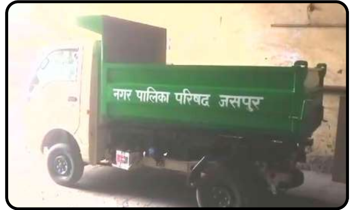
Open body Garbage Tipper