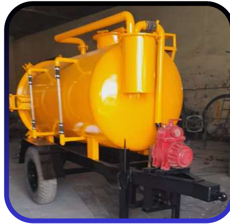
Sewer Suction Machine Trailer Mounted

A sewer suction machine is a specialized vehicle used to remove sludge, wastewater, and debris from sewers, manholes, and drainage systems. It uses a powerful vacuum pump to suction waste into a storage tank, helping to maintain hygiene, prevent blockages, and support efficient sewer maintenance.