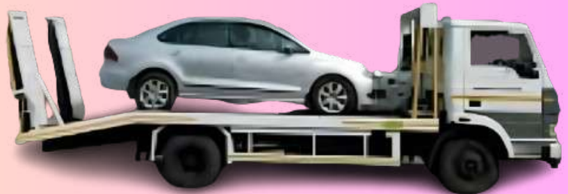
Recovery Truck / Tow Truck

A recovery van or truck is a specialized vehicle used to tow or transport broken-down, damaged, or illegally parked vehicles. Equipped with towing mechanisms like winches, cranes, or flatbeds, it ensures the safe and efficient recovery of vehicles from roads, accident sites, or restricted areas. Commonly used by roadside assistance services, traffic authorities, and towing companies.