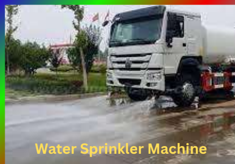
Water Sprinkler Machine