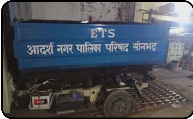
Open body Garbage Tipper