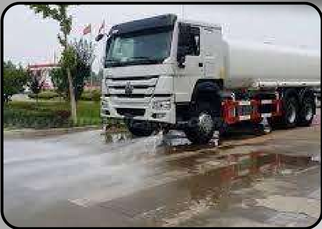
Water Sprinkler Machine