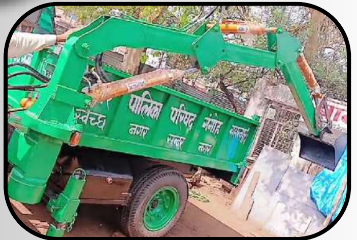
Nala Cleaning Machine

Our Trolley Mounted Nala Cleaning Machine is a compact, hydraulically operated solution designed for efficient open drain and nala desilting. Mounted on a sturdy trailer chassis, it features a robust hydraulic system with high-pressure hoses and control valves, enabling effective removal of silt and debris from drainage systems. Ideal for municipal and industrial applications, this machine ensures cleaner waterways and improved sanitation.