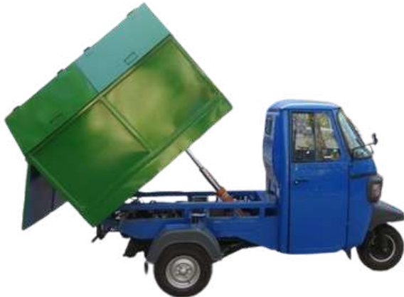
Close body Garbage Loader