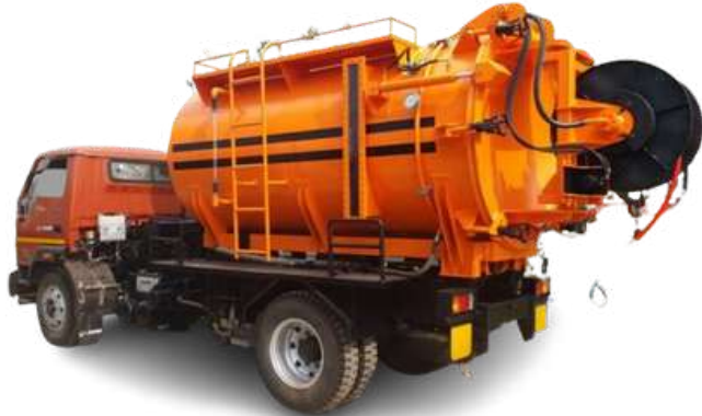
Chassis Mounted Sewer Suction Jetting Machine Trailer Mounted

A sewer suction machine is a specialized vehicle used to remove sludge, wastewater, and debris from sewers, manholes, and drainage systems. It uses a powerful vacuum pump to suction waste into a storage tank, helping to maintain hygiene, prevent blockages, and support efficient sewer maintenance.